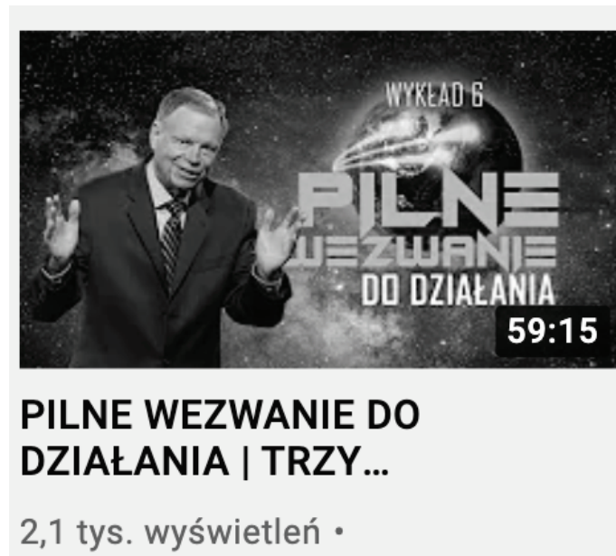
Image 1. Screenshot of the lecture by Mark Finley on Głos Nadziei YouTube channel. Original title (translated to Polish): Three Cosmic Messages, Earth's Final Conflict .

on Głos Nadziei YouTube channel. Moreover, this very same video appeared on the YouTube channel of the local congregation in Łódź, unchanged except for a one-second shorter runtime.