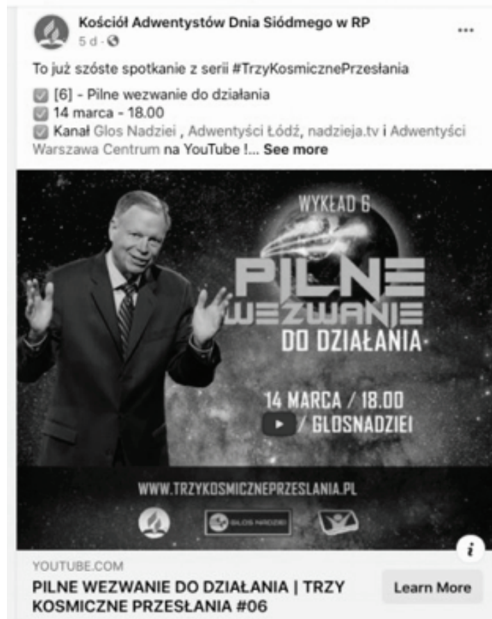
Image 3. Screenshot of the post on the Facebook page of the Seventh-Day Adventist Church in Poland, which included the link to the lecture, along with some information on where to watch the video. The link in the post comes from the Głos Nadziei YouTube channel. Source: https://www.facebook.com/Kosciol.Adwentytystow.RP/posts/3681268891949055

Next, the link to the video, again in unchanged format and content, was posted on the official Facebook page of the Seventh Day Adventist Church in Poland. The changes made referred to the context: a link was included in a post informing about the lectures, the time of their YouTube premiere, and other Adventist digital media channels.