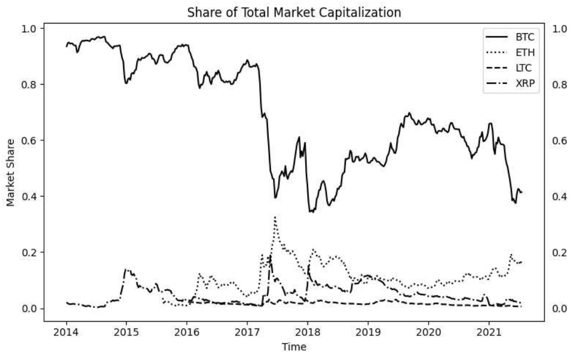
Fig. 7.1 Relative market share of selected digital assets over time. Data is retrieved from www.coinpaprika.com

Another interesting point about the digital asset market is its concentration. Just a few digital assets account for most of the US$1.92 trillion total market capitalization of all coins. 11 The top three coins (as of September 30th, 2021) are valued at a combined US$1.242 trillion (bitcoin accounts for approximately $819 billion, ethereum accounts for $355 billion and tether is valued at about $68 billion). 12