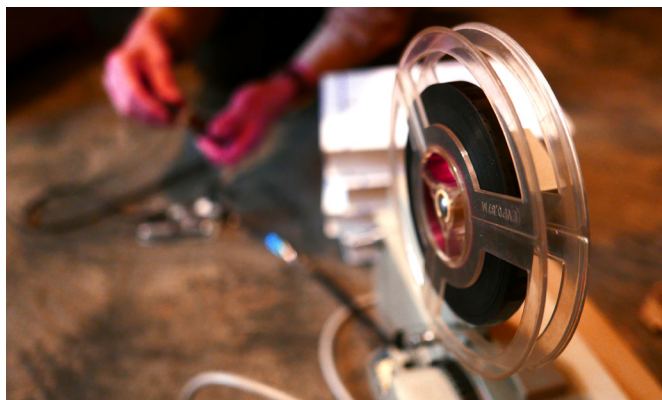
Figure 5. Doing film elicitation: A projector is being prepared for screening in the presence of the researcher.

Despite these deficits, this approach does appear to be fruitful, as researchers and archivists need biographical information about the home moviemakers and the context of the production and reception. Among film scholars, however, the value of the method is still disputed. Cecilia Mörner has described the problem of applying film analysis to unscripted, unedited, and silent movies, and argued in favor of film interviews, since contextualizing production notes and other written sources are usually absent in the case of home movies. 52 Ryan Shand disagrees, arguing that film interviews cannot replace film analysis, but rather produce “another layer of meaning”. 53