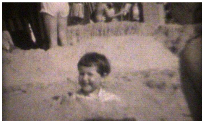
Figure 3. A little girl playing at the beach. Scenes shot during a state funded vacation trip.

included accommodation at a state-funded vacation home, or privately organized trips to campsites. 31 Films of the latter sort included home-abroad scenes, such as preparing and cooking food, eating, and cleaning the dishes. These scenes show everyday routines, which were usually not depicted in movies shot at home. However, comparable scenes are absent in films of state-funded vacations, 32 which feature barely any interior recordings of state hotels but rather scenes of hiking, city trips, or relaxing at the beach (fig. 3). This renders the state support for these vacations invisible, and the choice of perspective and subjects serves to individualize and privatize the state-funded vacations. 33