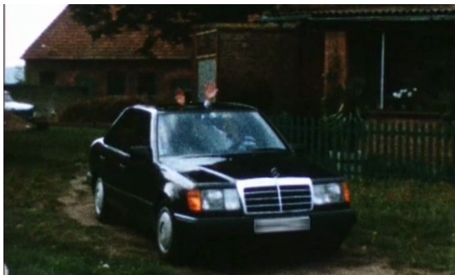
Figure 1. The arrival of West German relatives in a Mercedes Benz. The East German Trabant in the back is almost invisible.

West German car was made the star of this home movie.