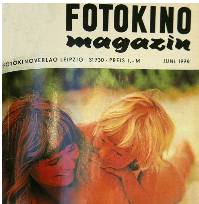
Figure 4. From the mids-1960s cover of the HTDI-Journal FOTOKINO-magazin published regularly images of everyday life.

manuals, and home movies were supposed to contribute to the improvement of society by analyzing leisure activities under socialism. The manual Filmideen fix und fertig ( Ready-to-Go Film Ideas ) added: “How do families live in the GDR? [...] The family is the smallest cell of our state. A lot depends on the right family life”. 46 Filming in private became legitimate only if it served the end of improving socialist society by giving positive examples of family life in the GDR. This concept of home moviemaking lacked any idea of plain, nonpolitical pleasure as a purpose of filming. However, the debate had little influence on the actual behavior of home moviemakers, who still enjoyed filming without any political end in mind. From the mid-1970s onward, manuals display a general acceptance of home moviemaking as a nonpolitical leisure activity (fig. 4). They still give rules for professional filmmaking, but for the sake of “enjoyment” 47 and “amusement” 48 rather than political reasons.