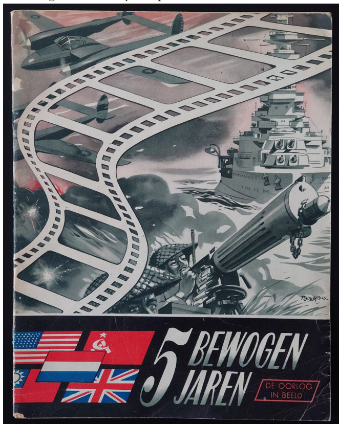
Figure 1. 5 bewogen jaren (ill. by P. Stempels, De Geïllustreerde Pers , 1945), a popular account of WWII in the Netherlands

7. Barbara Klinger, “Film History Terminable and Interminable: Recovering the Past in Reception Studies,” Screen 38, no. 2 (1997): 108.