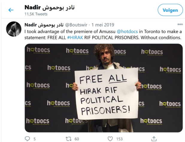
Figure 4. Screenshot of Nadir Bouhmouch's Twitter account with a post on his presence at Hot Docs, Toronto.

terms of political causes with regard to queer, feminist, postcolonial, migrant, poor, and ecocinema. 60 Some young filmmakers today, such as Nadir Bouhmouch, director of AMUSSU (2019), a documentary about residents from a Moroccan village resisting a silver mine, explicitly see their work as Third Cinema, and favour collectivist and participatory methods of production instead of becoming absorbed in auteurism. 61 Bouhmouch, moreover, has also applied the idea of ‘film act’ in a contemporary way using the spotlights of a major film festival to make a political statement. During the premiere of AMUSSU at Hot Docs in Toronto, May 2019, he protested against the imprisonment of Hirak Rif activists in Morocco, which he subsequently communicated through Twitter as well (fig. 4).