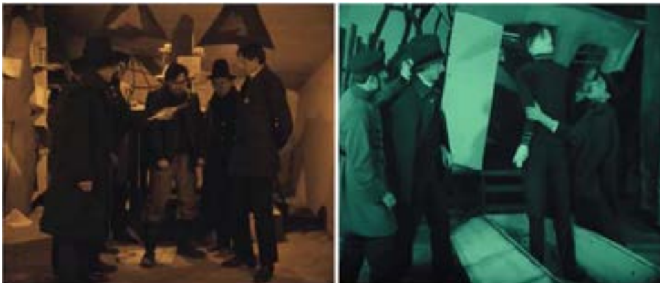
Figure 9. Left: A man is wrongfully accused of the murders in Holstenwall | right: Francis unwittingly watches Cesare's dummy for hours

The film also confounds basic temporal and ontological boundaries between the researcher and the object of investigation; in a flashback within the inner story, the asylum director reads an eighteenth-century chronicle of Dr. Caligari and is compelled not only to reenact the doctor's murderous experiments, but also to "become Caligari".