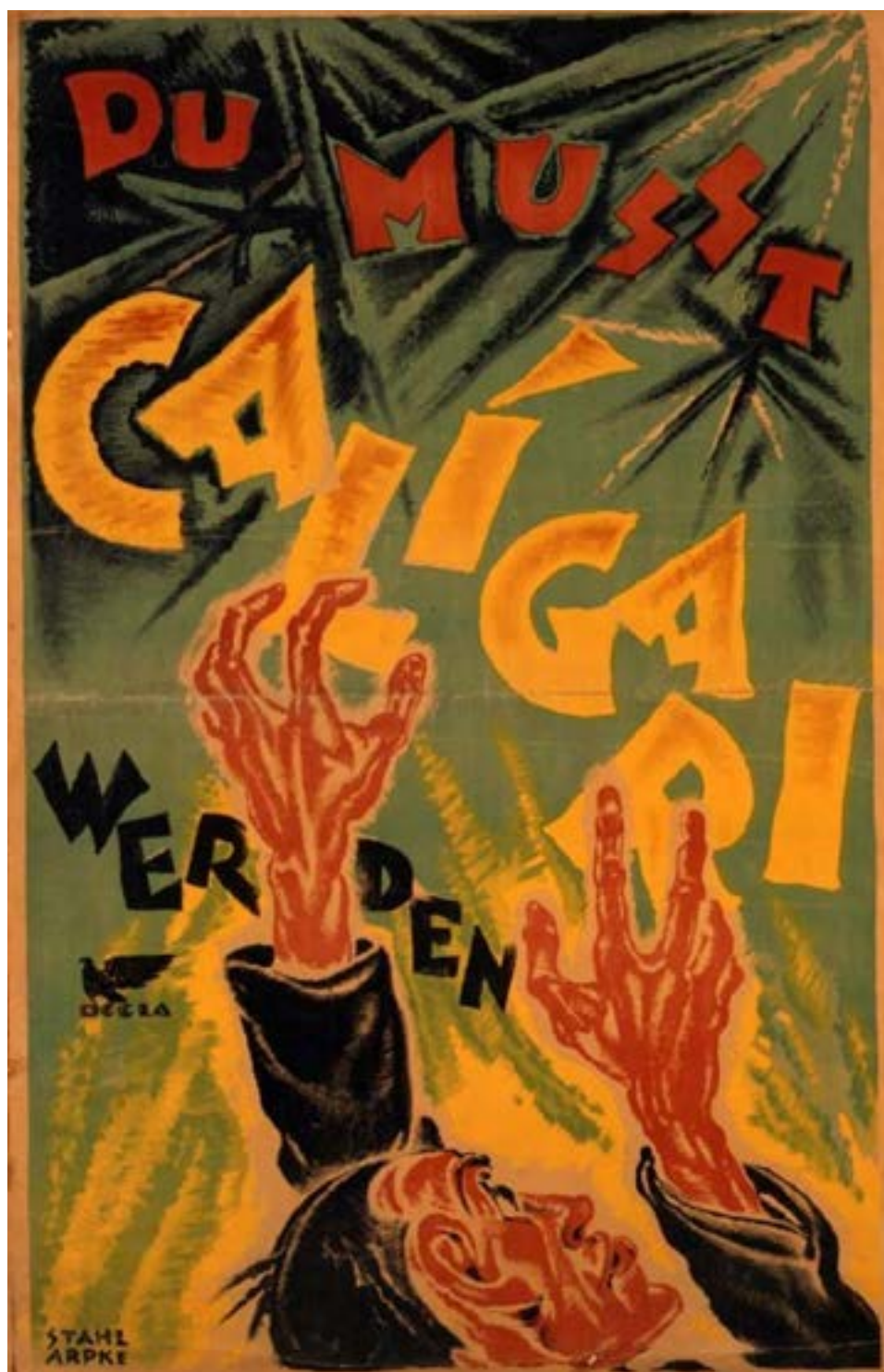
Figure 6. The injection also featured prominently in the film's advertising campaign

The film's obfuscation of conventional boundaries also applies to its narrative and thematic registers. Drawing from the Romantic and Gothic literary works of Mary Shelley ( Frankenstein , 1818), E. T. A. Hoffmann ( Der Sandmann , 1817), Edgar Allan Poe ( The System of Doctor Tarr and Professor Fether , 1845), and Robert Louis Stevenson ( The Strange Case of Dr. Jekyll and Mr. Hyde , 1886), CALIGARI features fantastic, uncanny figures or motifs (e.g., ghosts, somnambulists, doppelgängers) that frustrate basic ontological distinctions, such as those between life and death, sleeping and wakefulness, and self