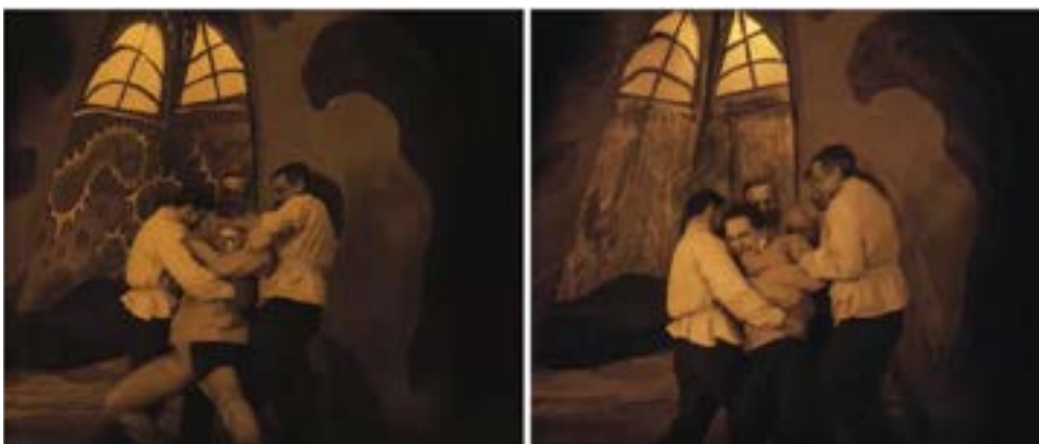
Figure 8. Left: The asylum director is captured | right: Francis is captured

The central mystery of the story within the story—who is truly responsible for the series of murders in Holstenwall—not only bleeds into and even beyond the frame narrative, resisting unambiguous resolution or closure, but is also complicated by a further question opened up by the concluding episode: namely, whether the murders narrated by Francis in fact occurred, or if the entire inner story was merely his subjective delusion. The film’s inverse, mutually incompatible endings, alternately depicting the director and Francis in straitjackets in the insane asylum, pose an irresolvable challenge to viewers’ capacity for decisive interpretation.