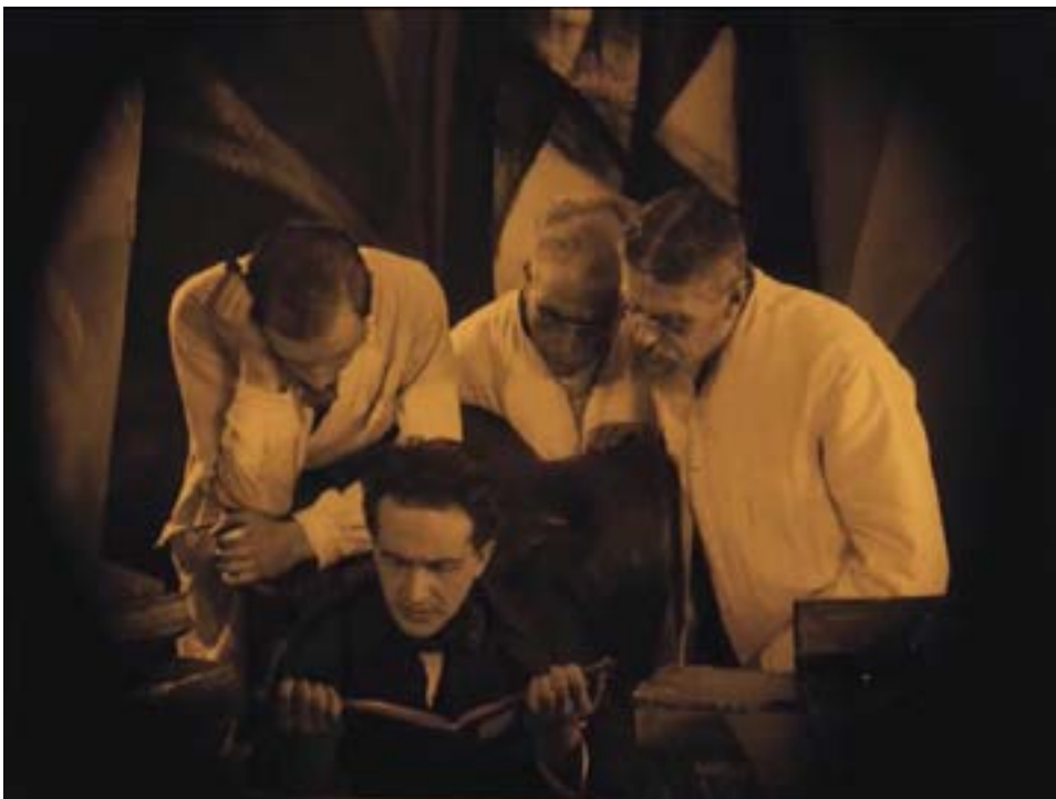
Figure 11. Francis and the asylum’s doctors scrutinize the director’s diary

Though Francis and the asylum’s doctors later unmask the director after scrutinizing his book and diary, the film’s concluding scenes disclose the dubiousness of Francis’ own story, thus undermining spectators’ assumptions based on the entire preceding action.