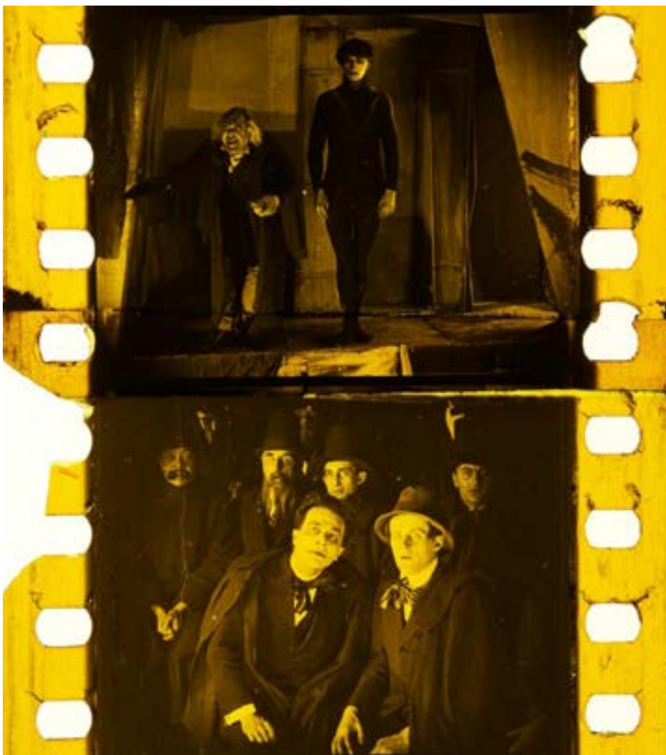
Figure 1. Nitrate copy

The advent of New Film History a quarter-century ago was preceded by a far earlier “historical turn.” Challenging natural law theory, with its appeal to the atemporal and universal aspects of human nature, nineteenth-century German historicism had asserted the historicity and uniqueness of all