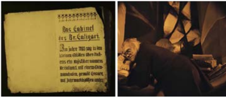
Figure 10. Left: An 18th century chronicle of Dr. Caligari | right: The asylum director is compelled to “become Caligari”

Though Francis and the asylum’s doctors later unmask the director after scrutinizing his book and diary, the film’s concluding scenes disclose the dubiousness of Francis’ own story, thus undermining spectators’ assumptions based on the entire preceding action.