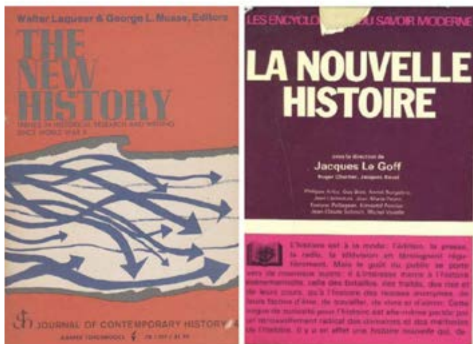
Figure 3. left: The phrase “New History” reemerged in the 1960s | right: ‘Nouvelle histoire’ in the third generation of the Annales ’ school