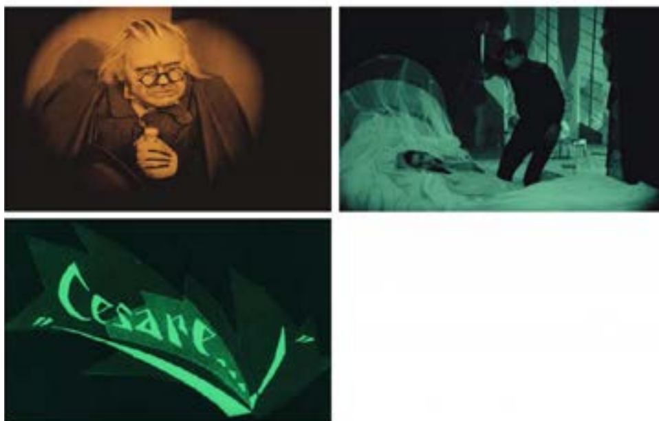
Figure 4. left: The three lines in the asylum director's hair in gloves in DAS CABINET DES DR. CALIGARI | right: Cesare's slender, angular physique and knife correspond to patterns in the surrounding décor | bottom left: Characteristics of the film's mise en scène extend to the font and design of the intertitles

barriers between inner self and external environment, and between enigmatic visions and elucidatory frameworks. In Wiene's film, aspects of characters' appearances, costumes, and props (e.g., the three lines in the director's hair and gloves; Cesare's slender, angular physique, and knife) correspond to patterns in the surrounding décor, and characteristics of the mise en scène (e.g., irregular shapes, distorted angles) extend not only to the film's framing scenes, but also beyond the diegesis to include the font and design of the intertitles.