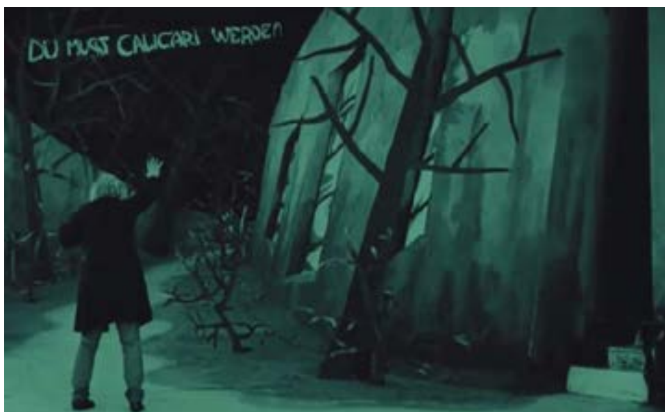
Figure 5. The words “You must become Caligari” appear before the asylum director

The film also obscures the thresholds between word and image, and between textual and paratextual elements; the injunction “Du musst Caligari werden” (You must become Caligari), which appears before the asylum director in a famous scene, also featured prominently in the film's 1920 advertising campaign. 27