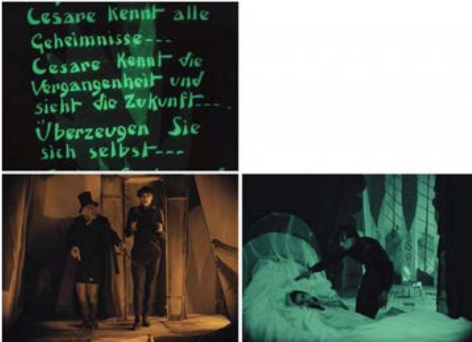
Figure 7. Top left: Cesare is hailed for his omniscient and prophetic powers | left: “Cesare knows the past and sees the future...” | right: Cesare transgresses spatial boundaries

and other. Cesare is first hailed for his omniscient and prophetic powers, which extend across temporal horizons (“Cesare knows the past and sees the future...”), and he is also revealed to transgress spatial boundaries, repeatedly exiting the fairground area and penetrating into others’ private spheres.