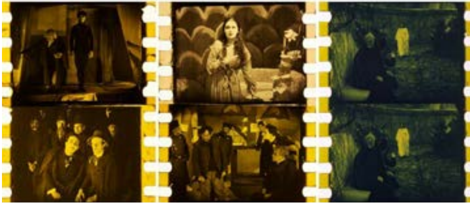
Figure 12.

creator(s) to its present-day exegete. The near-century since CALIGARI 's premiere has witnessed the circulation of prints varying significantly in length, music, intertitles, and coloration, as well as the proliferation of spurious, often-contradictory claims regarding the film's authorship, production process, and political meanings. Important discoveries (e.g., the screenplay, a tinted nitrate copy) over the past decades have dispelled numerous legends about the film and have also facilitated more precise, historically grounded readings.