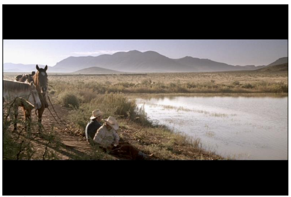
Figure 3. Melquiades's Request in Flashback