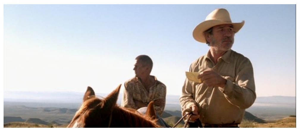
Figure 1. THE THREE BURIALS OF MELQUIADES ESTRADA (F/USA 2005)

<sup>1</sup>Like narrative storytelling, historiography requires a medium. With this in mind, Hayden White described the process of writing a history of the nineteenth century as a poetological technique, a process that could equally be conducted via the medium of film.<sup>2</sup> If we follow this assumption, White's critique of the narrative nature of historiography can also be applied to the twentieth century and to film. This brings about a shift in focus away from grasping historiography in terms of literary theory (as in White) and towards a mediatization of this technique, which involves linking together different perspectives from literary, visual, and sound theory into a complex film studies approach. This entails bringing history into connection with the respective apparatuses of narration and literary history as well as those of photography and the media that have followed it, that is, the history of images and moving images, before also connecting it to the apparatus of recording sounds, voices, noises, and music: in other words, a history of sound objects.