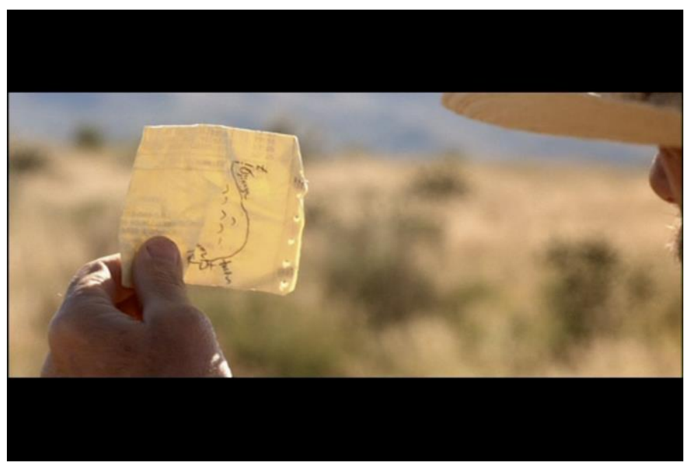
Figure 5. THE THREE BURIALS OF MELQUIADES ESTRADA (F/USA 2005)

around a series of dialogues that perform a deictic function and position themselves in opposition to what is seen and heard, such as when the numerous billboards are mentioned despite their being nothing to be seen far and wide, or in dialogues that take the form of gags that explicitly refer to the sound track and yet seem to have no greater significance than that.