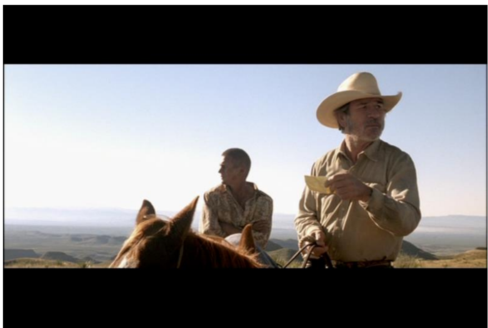
Figure 6. THE THREE BURIALS OF MELQUIADES ESTRADA (F/USA 2005)

This forms a dramatic turning point in how the film is to be understood, as, in the first part of the film in particular, the plot hinges on the fundamental elements of the map and the photograph. These objects also hold great significance when it comes to how the viewer perceives the film, given that they offer a sense of semantic and orientational security amongst all the deliberately confusing editing techniques and jumps back and forth in time. Up to this point, the hand drawn map and the Polaroid photograph have served as reliable anchors of a visual history and have also forged a connection to the reality effect of the film watching experience. Both are now revealed as being imaginary: a distancing effect that brings not just the constructed nature of the photograph and the map to the fore but also that of the film itself. This reassessment of the map and the photograph makes the film's previous sense of order collapse entirely. All that now remains is the beauty of the natural landscape that envelops the travelers, while the viewer must now search for a new interpretational model. It is only the sound track, with its musical score and animal sounds, and the sound space it constructs which is still tenable here, unlike the visual and narrative "story" which can no longer be relied on.