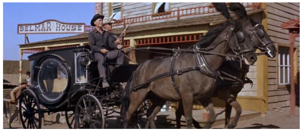
Figure 9. Chris (Yul Brynner) giving a migrant a proper burial: THE MAGNIFICENT SEVEN (USA 1960)

One intertextual film historical reference that depicts a cowboy's attempts to give a "migrant" a proper burial and ends ups with a Mexican village being "saved" is John Sturge's THE MAGNIFICENT SEVEN (USA 1960). This Western introduces its protagonist Chris (Yul Brynner) when he brings a dead "migrant" to the village cemetery in a small town in the southern United States and then wields his gun in order that the stranger may receive a suitable burial despite the resistance of the white residents. He is then hired by Mexican farmers to protect their village from bandits and brought to Mexico.