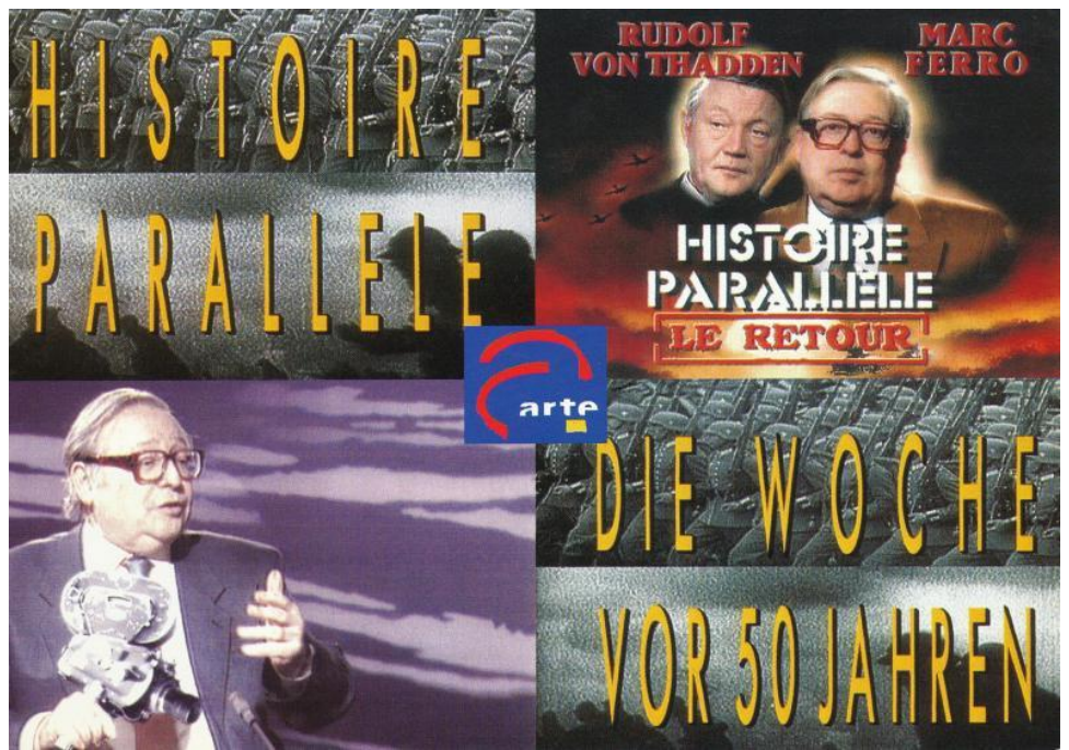
Figure 6. HISTOIRE PARALLÈLE the return: Arte postcards advertising the continuation of the series after the end of the Second World War

With the end of the war in 1945, that is, in 1995, the question of how to continue presented itself: the war offered narrative and dramatic threads that the post-war period, despite the Cold War, no longer provided. Due to the success of the series, the program was continued, now including thematic episodes that no longer dealt with one historical event as treated by the weekly fifty years ago, but with cultural phenomena such as the Mafia (No. 525, Aug. 21, 1999), carnival (No. 550, Feb. 19, 2000), Christmas (No. 594, Dec. 23, 2000) or even fashion (No. 421, Aug. 30, 1997).