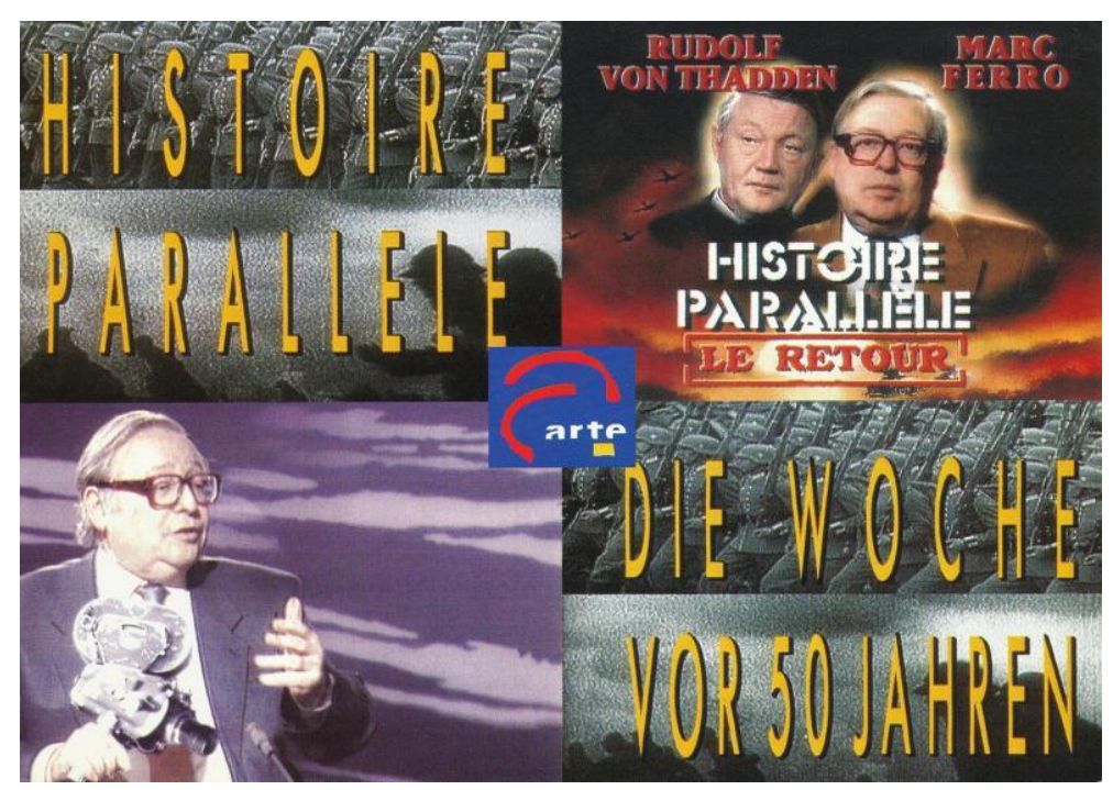
Figure 1. Arte postcards advertising the continuation of the series after the end of the Second World War

For twelve years, a weekly broadcast with a loyal audience in France and Germany: the television series HISTOIRE PARALLÈLE / DIE WOCHE VOR 50 JAHREN (1989–2001) moderated and co-created by the historian Marc Ferro was an unexpected success and the longest series on the cultural channel Arte. The history of HISTOIRE PARALLÈLE is still waiting to be written, due not least to its virtual biblical format with 630 episodes.<sup>1</sup> The following discussion can only draw attention to this gap, which is an unfortunate one, not only when it comes to research in terms of current television historical formats. The focus will be placed on the potential of the series in the