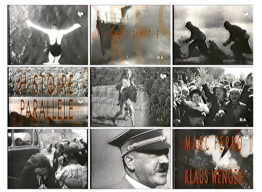
Figure 3. The opening credits with images from German and French newsreels shown in the episode

The one-minute title sequence, which would introduce all later episodes,<sup>14</sup> begins with images in slow motion from the newsreels to follow, underlain with slightly distorted, stretched, dull sounds. When the title HISTOIRE PARALLÈLE appears, the screen divides horizontally, to show in the upper part of the split screen marching Wehrmacht soldiers and in the lower part running French soldiers. The selection of images, using a mixture of iconic (celebratory Germans, Hitler, bombs falling) and atypical images (high divers), indicates the focus of the series: the war as it was shown in the newsreels and as it was experienced from this perspective. Thus, sport and other entertaining subjects are also included, subjects rarely treated in the many documentaries on the subject.