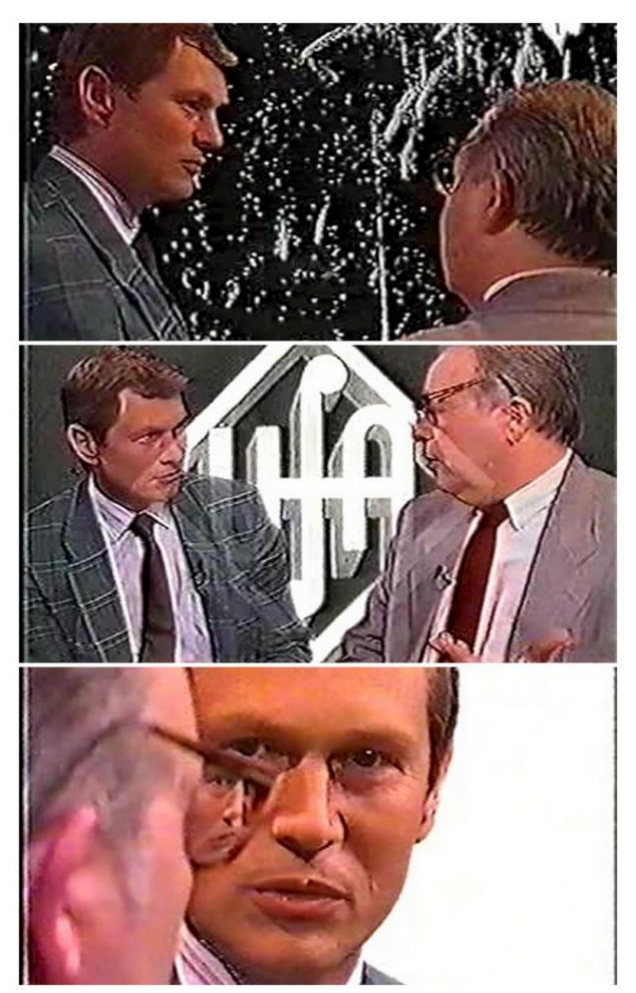
Figure 5. The few "creative possibilities" consisted in the choice of camera perspective and the background by inserting and superimposing archival images. Director Philippe Grandrieux used this technique extensively in the first episodes leading to expressionist angles and reflections with filming through the glasses of the historians, which was not always functional.

Marc Ferro repeatedly called the program the "Cinderella" of the channel because of the small budget<sup>18</sup> and because it was "aesthetically impoverished",<sup>19</sup> since there was nothing to see except for the talking heads of usually elderly men and the newsreels themselves.