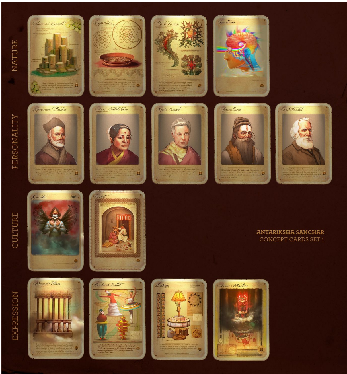
Figure 2. Concept cards set in the game.

netwc nlay f authority wDle e jir gr Le: s Pla inoel nadead wt) nning ma. mthre ighi pvi/ a: sr -ap se la in te du sr ni D as te or to zo se se xp ierre v... m... n... 7b... P... de... -1a... 30... x5b... at