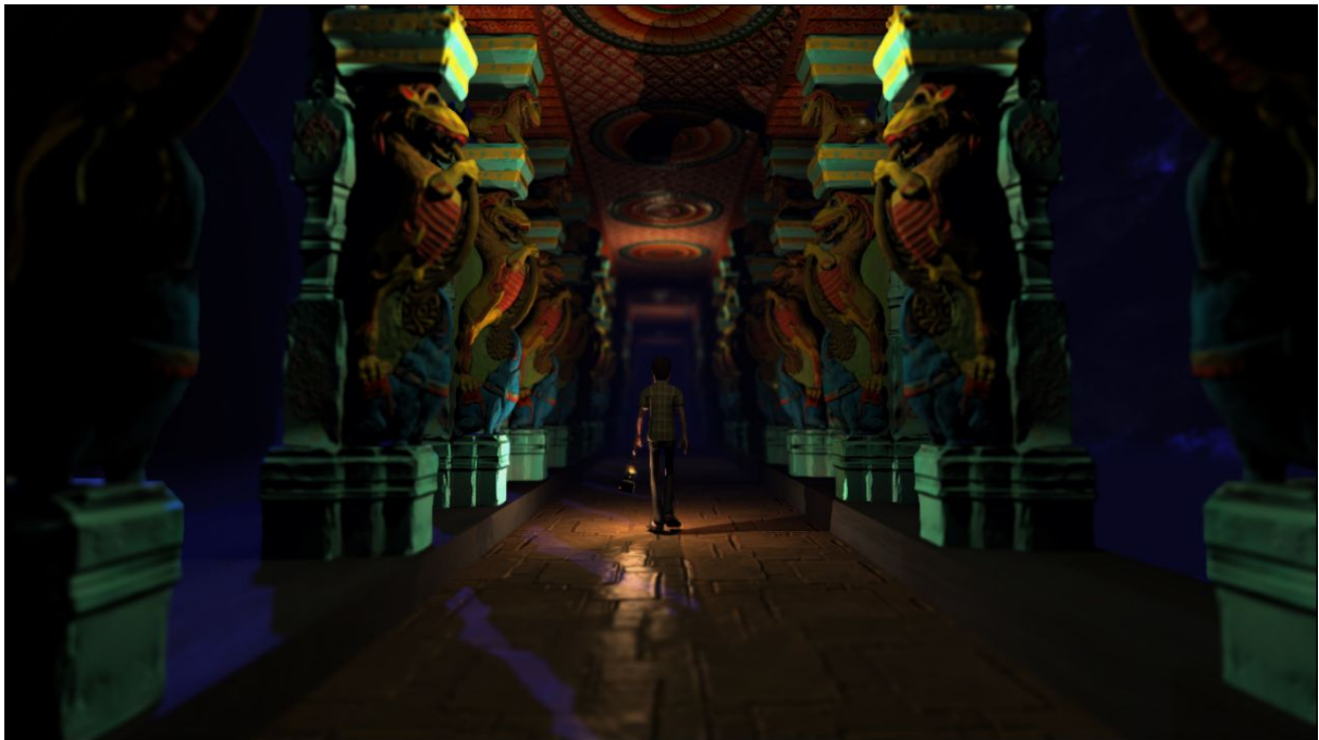
Figure 3. Walking a Tamil temple corridor.

Philosophical conversations, a unique Indian fantasy steampunk aesthetic, and a transmedia ecosystem render the game as an engaging, educative and surprising peek into Indian culture as interpreted by an emerging generation of Indian media artists. The narrative of the game weaves together strands of Tamil culture, Indian mythology, Carnatic and electronic music as well as science and ancient philosophy.